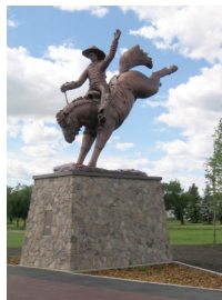
The Legacy - World's Largest Bucking Saddle Bronc Horse & Rider