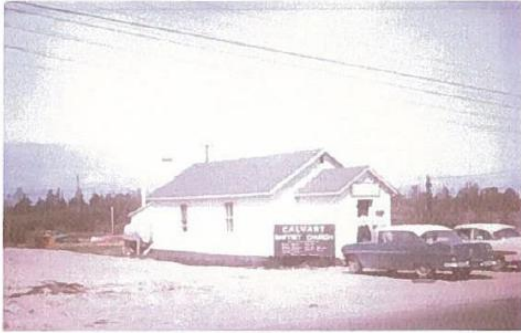
The first building Circa 1954